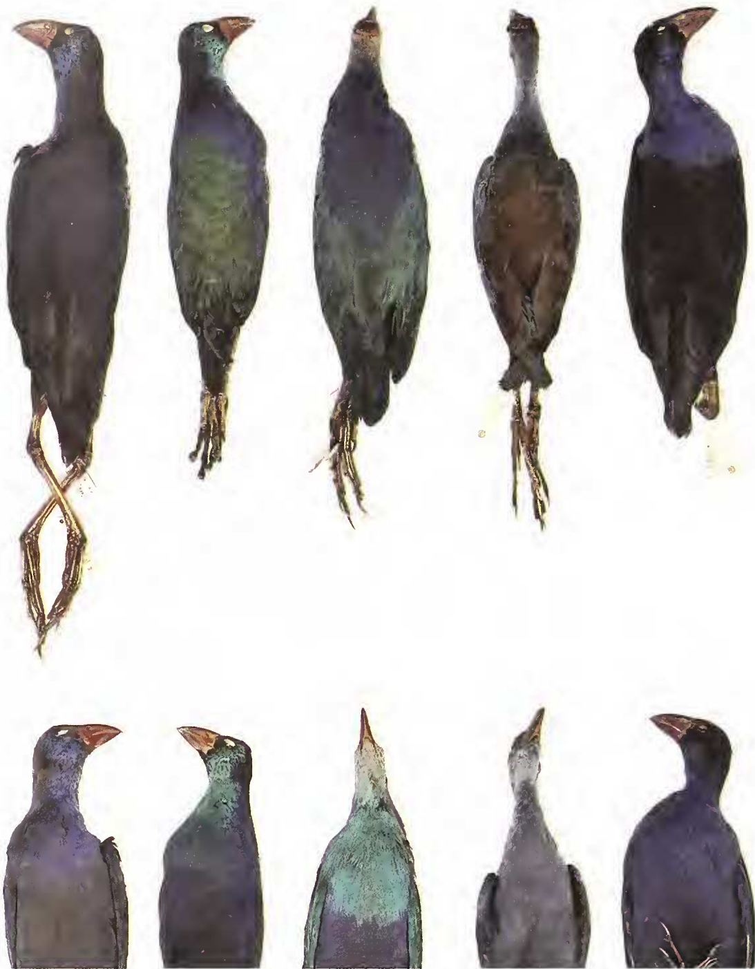
Figure 22. Coloration of different subspecies of Purple Swamphen Porphyrio porphyrio, dorsal (above), ventral (below), from left to right: P. p. porphyrio (NHMUK 1905.6.28.1010), P. p. madagascariensis (NHMUK 1955.6.N.17.38), P. p. poliocephalus (NHMUK 1881.12.29.31), P. p. pulverulentus (NHMUK 1842.2.15.140) and P. p. melanotus (NHMUK 1887.5.2.66)